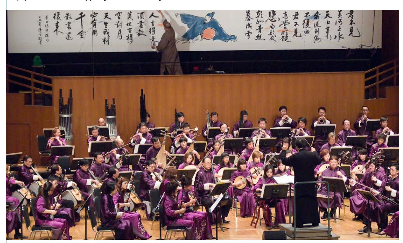
The concert 'Poetry, Music and Painting' attempted to exemplify the bedrock of Chinese culture by bringing together poetry, music and painting, three mainstream refined arts in the Chinese literati tradition.