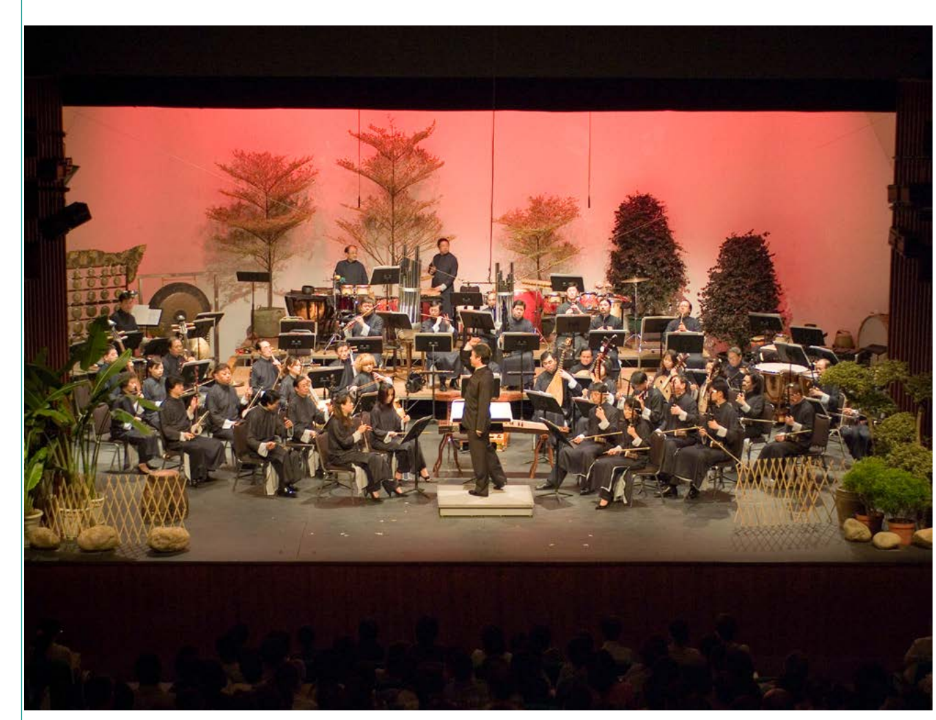
Our signature concert series 'Music for Tranquility of Mind' was a music soul spa for the audience's enjoyment.

After establishing partnership with the Hong Kong Cultural Centre, HKCO organizes various educational music activities there. They include 'Joining the "Chinese Music World Today", a lecture series on Chinese music, and the 'Chinese Music Express', small group performances held regularly in the lobby. Other activities include the 'Chinese Music DIY' and the 'Hong Kong Huqin Marathon', which was live-broadcast round the clock although it could not come to a full completion because of a typhoon. These changes in activity modes show that HKCO has unlimited creativity and constantly seeks means to materialize its Mission Statement. This also allows the orchestra to be more diversified in the forms and contents after its incorporation.