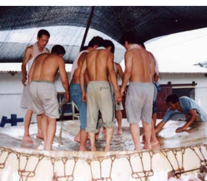
In 2003 during the post-SARS era, HKCO established the Hong Kong Drum Festival, and commissioned Shanxi Jiangzhou Drum Troupe to tailor-make a Chinese drum which was 3.47 m in diameter so as to bolster and consolidate the Hong Kong people. This event was one of the vibrant economic policies of the SARS government and was supported by the district councils of Hong Kong and various sponsors. Over 3000 Hong Kong citizens from 600 organizations played a drum piece which marked another Guinness World Records entry and boosted the morale of the Hong Kong people.