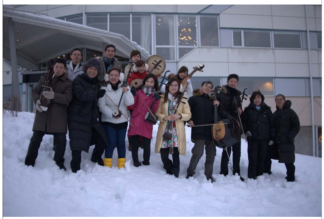
The HKCO Ensemble travelled to Oslo, the northern city of Norway (350 km from the Arctic Circle) to perform in Northern Lights Festival (Nordlysfestivalen). This was also the first Chinese instrumental ensemble concert in the festival.

A "unique tone" cannot be established in a short while. The success of HKCO's Eco-Huqin Series has stimulated attention to other instruments and has led players of other instruments to care more about the sound quality of theirs. Their concern goes beyond the volume and strength of the music they play. In the first couple of years after it has been incorporated for two decades, HKCO's tune quality has become more profound and delicate, forming an increasingly intricate and fine ensemble art. This is where the most precious tradition of HKCO lies. The next five years will be the key to the continuation of this tradition of HKCO!