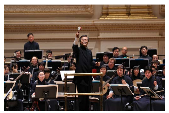
HKCO was invited by the Carnegie Hall, New York to perform at "'Ancient Paths, Modern Voices: Celebrating Chinese Culture" Festival Concert'.

Jeffrey's view is of course the professional opinion of a musician. It is also the feeling of the average European audience who are accustomed to Western symphony tradition. The music effect and artistic expression of an orchestra can play is obviously one of the most important criteria for the audience. Hence, it is not unexpected that the symphonic HKCO can "conquer" the audience who have grown up on the land of symphony music.