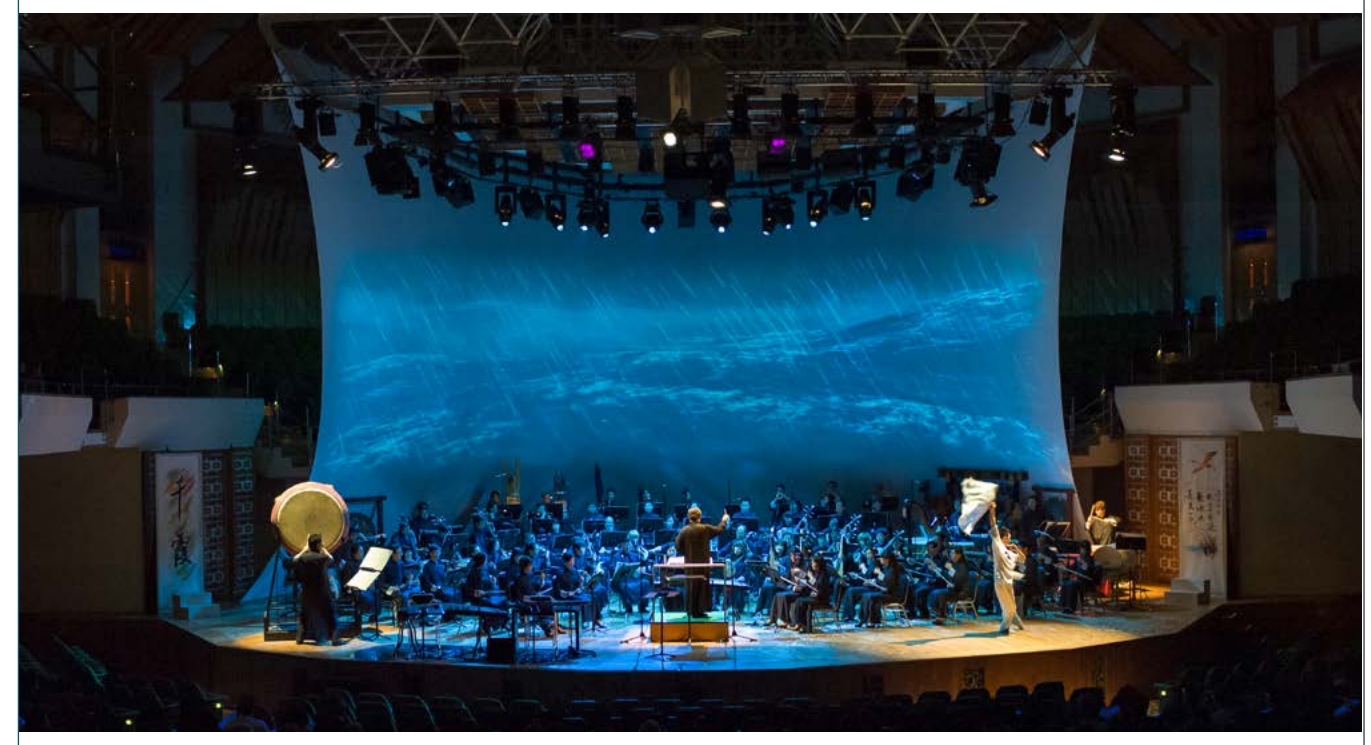
Crossmedia Chinese music theatre 'Ode to Water', composed by Dr Mui Kwong-chiu, included elements such as calligraphy, Chinese poetry, visual images, dance and videos.

In addition to the production of these tradition-breaking works for large-scale Chinese music ensemble, HKCO has set up a folk music group to explore and perform traditional Chinese folk music, a chamber music group that pursues refined taste, and even the HKCO Pop that integrates Chinese music with pop. After its incorporation, HKCO has adopted an "all-round" strategy and ideology to seek larger and broader development space for today's Chinese orchestra!