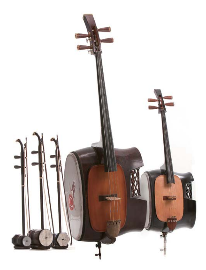
'Eco-Huqin Series' – (from left) gaohu, zhonghu, erhu, bass gehu and gehu.

The biggest difference between HKCO's recent concerts at home or abroad and those in the past is that the huqin family of the string instruments in the Orchestra have all been replaced with the Eco-Huqin Series. HKCO's recent visits abroad have been very popular. Both Chinese and foreign audiences are intoxicated by its performance, not feeling fatigue throughout the entire concert of over two hours. The merits should be attributed to the eco- huqin . HKCO's efforts on the research and development of musical instruments over the years are not merely worthwhile; they are super-worthy. The recent verification of the Eco-Huqin Series has finally granted HKCO a global passport.