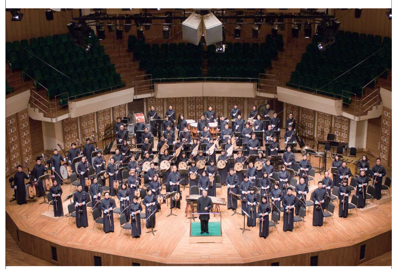
'The Eight Immortals' Adventures' was a multi-media production which transformed the Hong Kong Cultural Centre Concert Hall into a grand theatre installation, combining arts of various genres such as sand painting.

These series have become the basis of HKCO's design so far. The names of some of the series have been revised over time but the design of basic contents and ideas still follow the spirit of "based in Hong Kong with global vision" enshrined in the Mission Statement.