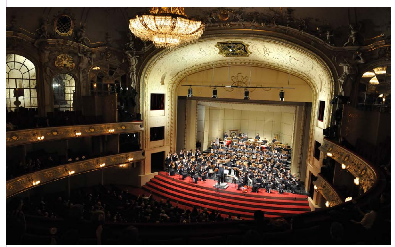
The concert at Komische Oper Berlin received a standing ovation, which showed the orchestration of HKCO had "conquered" the audience in Europe.