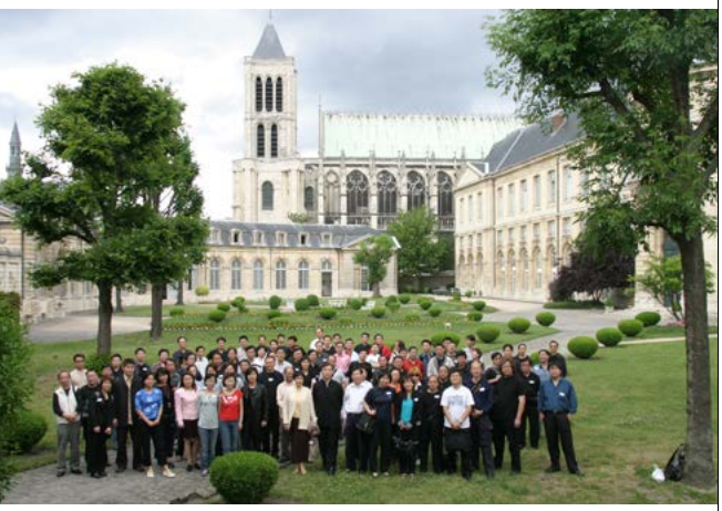
During Les Années Chine-France, HKCO was invited to perform in Paris for the first time, the first concert was held at Pavillon de la Legion d'Honneur, while the second was held at the Basilica of Saint-Denis.