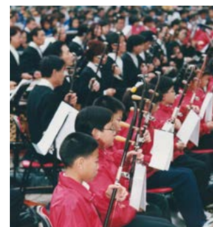
The first Hong Kong Huqin Festival attracted 1,000 participants from different age groups and nationalities, which showed that music has a universality that breaks boundaries.